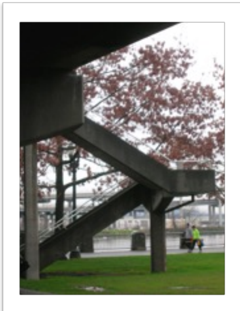
Public toilets can fit unused spaces such as under this stairway.

Start with a quick walk about to map existing restrooms, determine where more are needed and note or photograph sites where new ones could be established. As not all options fit all sites, a quick preliminary mapping exercise will get you started.