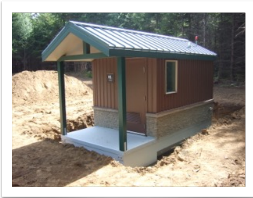
Some models are transported to site as kits or fully assembled.

Sidewalk toilets are easier to site in urban areas. Automatic Public Toilets (APTs) are the enclosed, self-cleaning kiosks that first appeared in Paris. For a variety of reasons, they have enjoyed very limited success in North American cities. In contrast, the non-automatic Portland Loo 5 , which fits on the sidewalk or in an adjacent parking space, is gaining popularity in cities throughout North America.