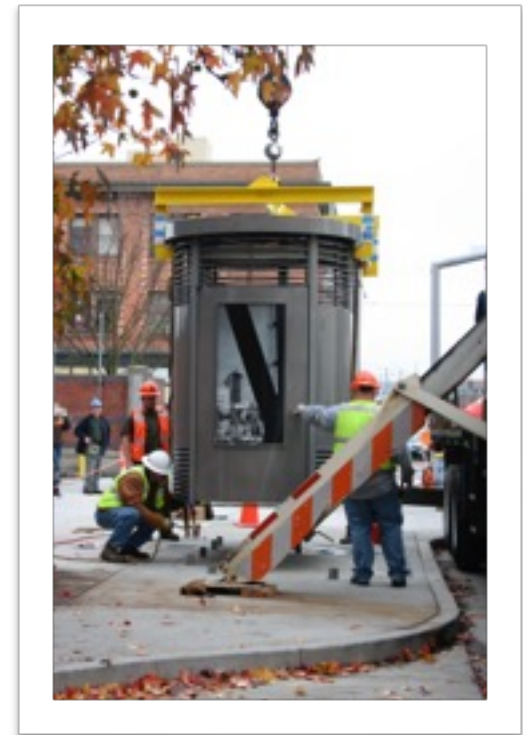
A crane lowers a Portland Loo from truck to sidewalk

A few U.S. cities have implemented similar